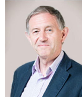
Glen Grant UK